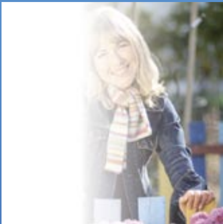
Field Loss from Acquired Brain Injury