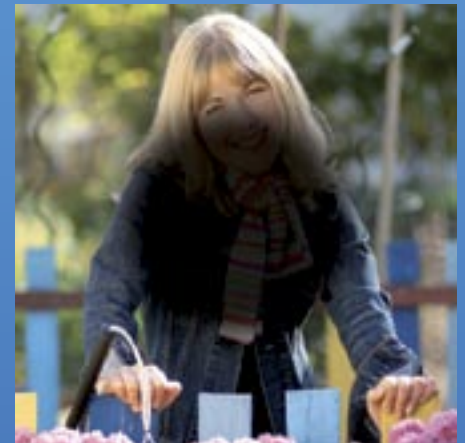
Age-related Macular Degeneration

We offer the following FREE services across Victoria through domiciliary or residential training: