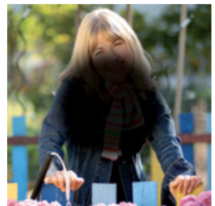
Age-related Macular Degeneration