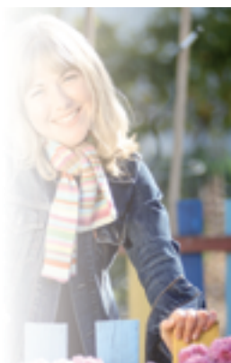
Field Loss from Acquired Brain Injury